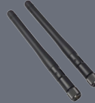
2 External Antennas