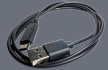
USB Cable Type A to C